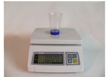
6. Measure Maximold Silicone catalyst, 10% of weight of base