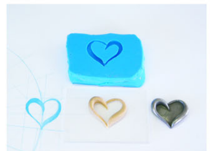
12. Finished mold used to create Easycast Jewellery with tin powder