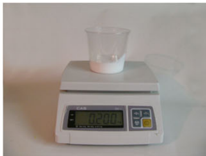
5. Measure Maximold Silicone base