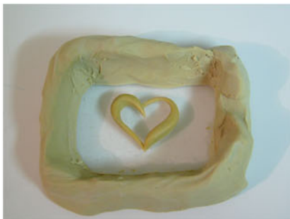
4. Make Klean Klay wall 10mm taller than the model