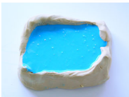
10. Allow to set for 12+ hours