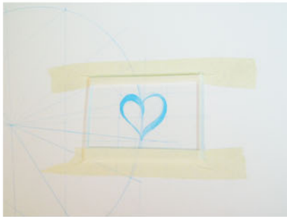
1. Tape clear acrylic over finished design