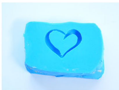
11. Remove Klean Klay to save for another project. One part mold now finished