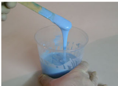
8. Mix to a uniform colour