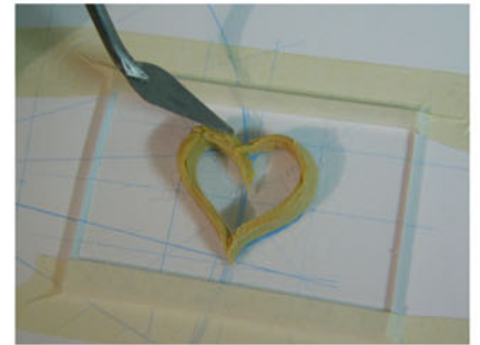
3. Using sculpting tools, shape Klean Klay