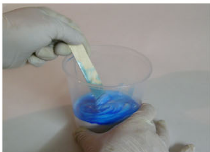
7. Mix base and catalyst thoroughly